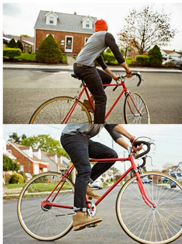
SKINNY JEAN | STYLE No. 5060