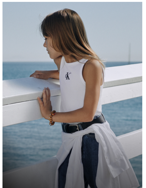
Girls Back-to-school looks in effortless layering. Suzanne Meyer